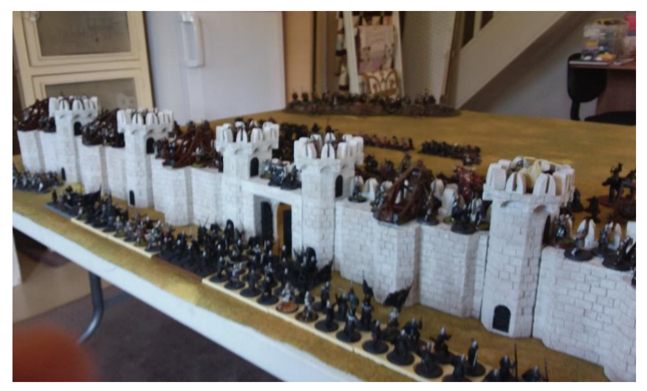
The city walls are manned and ready, as well as back-up within the city itself