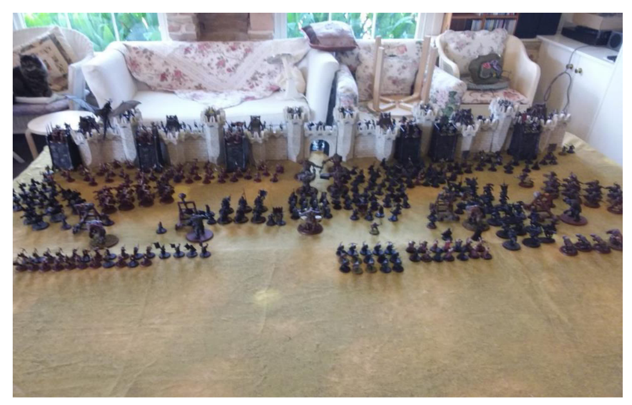
Despite a heroic defence the Gondorians are pushed back into the city and the Mordor army rolls on to the attack