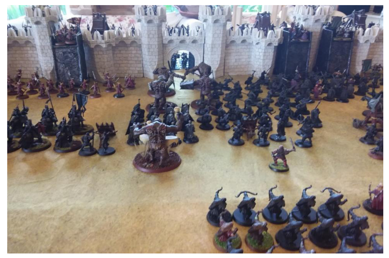
The siege towers are now in place and Mordor forces are on the battlements. The trolls head for the main city gate