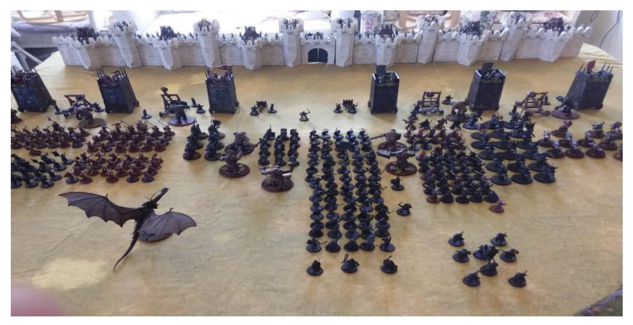
Mordor army invests Minas Tirith after crossing the townlands and fields between the River Anduin and the "White City"