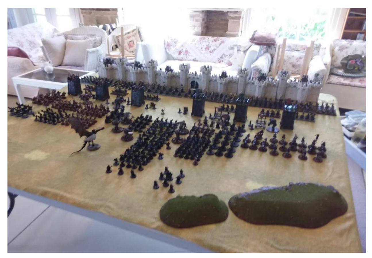
Gondor army and fiefdoms deploy before the city walls to do battle