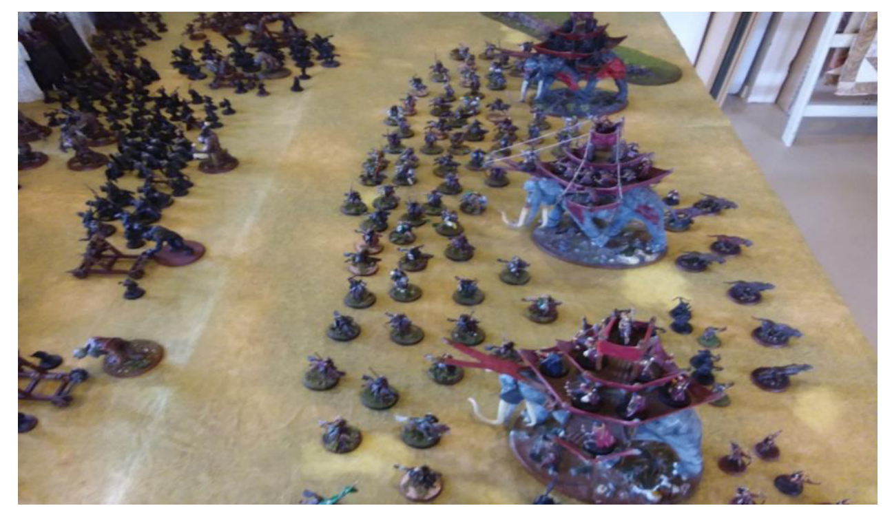
The Rohirrim split the Mordor army and are on the verge of success when the Mumakils (called "Oliphaunts" by the Hobbits) appear