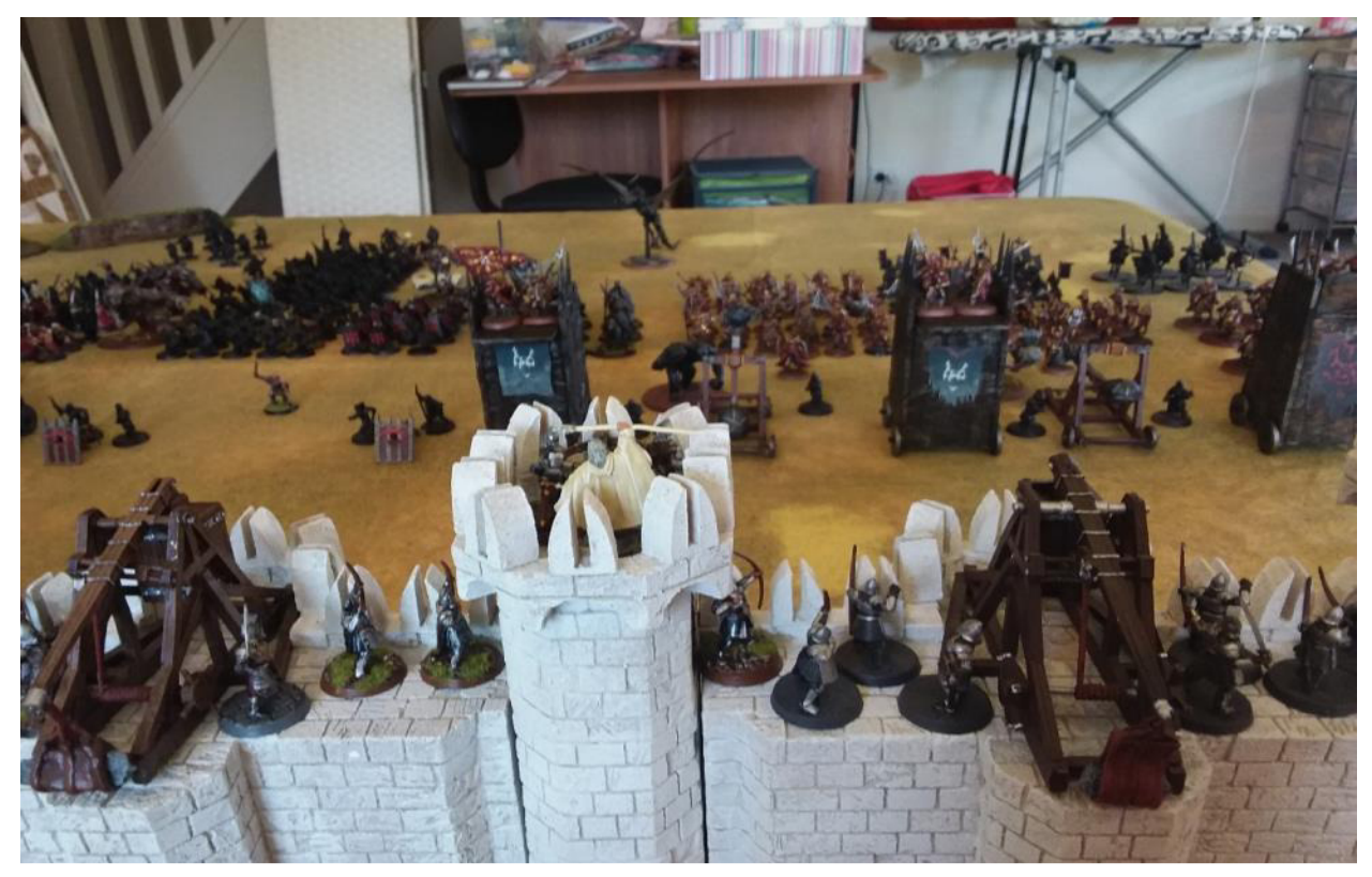
Gandalf the White views the Mordor hordes from the battlements