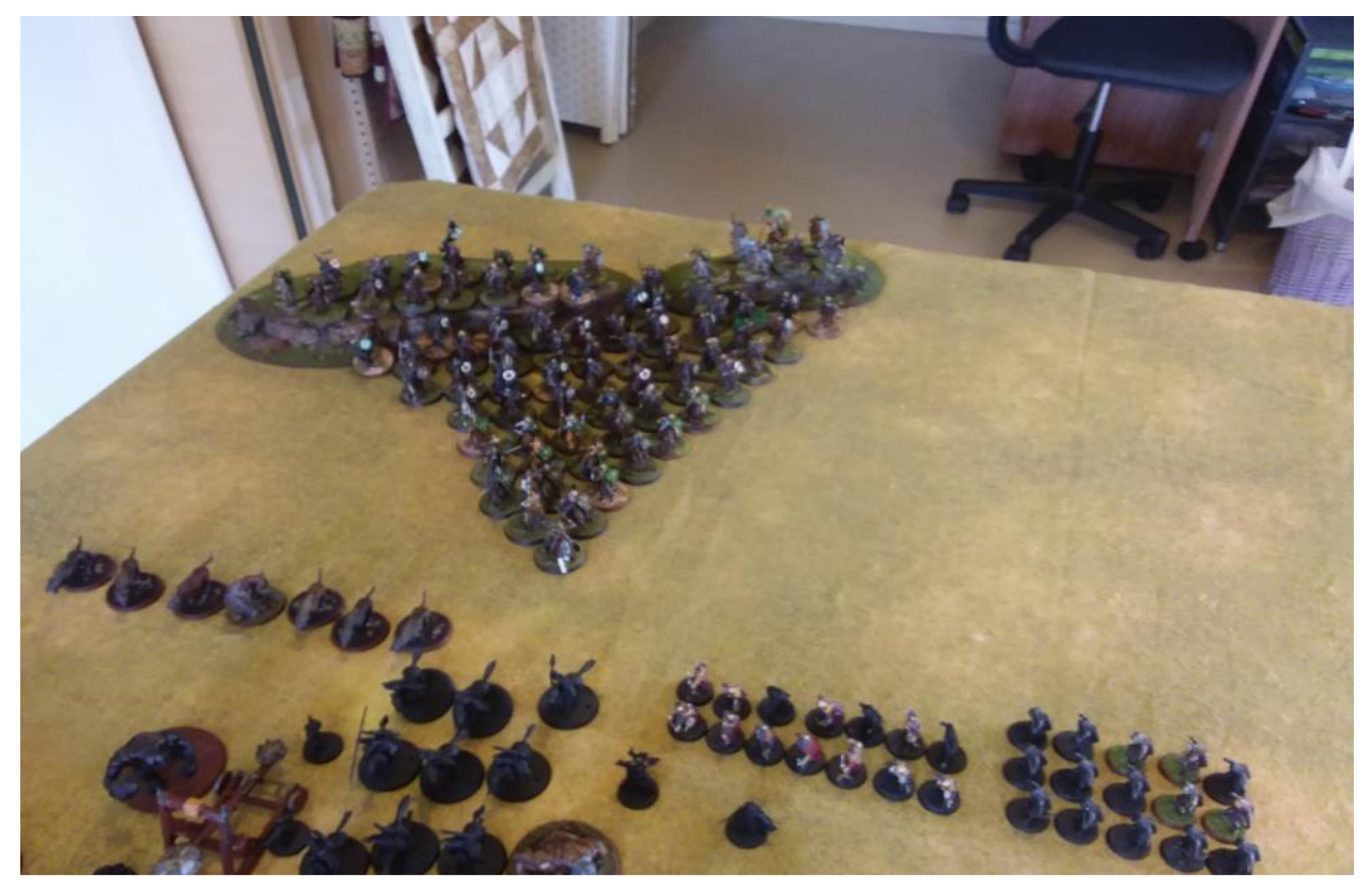
The forces of Rohan have honoured their pact with Gondor and form an arrow-head formation to strike at the heart of the Mordor army. Trumpets bray and the Rohirrim enter the fray