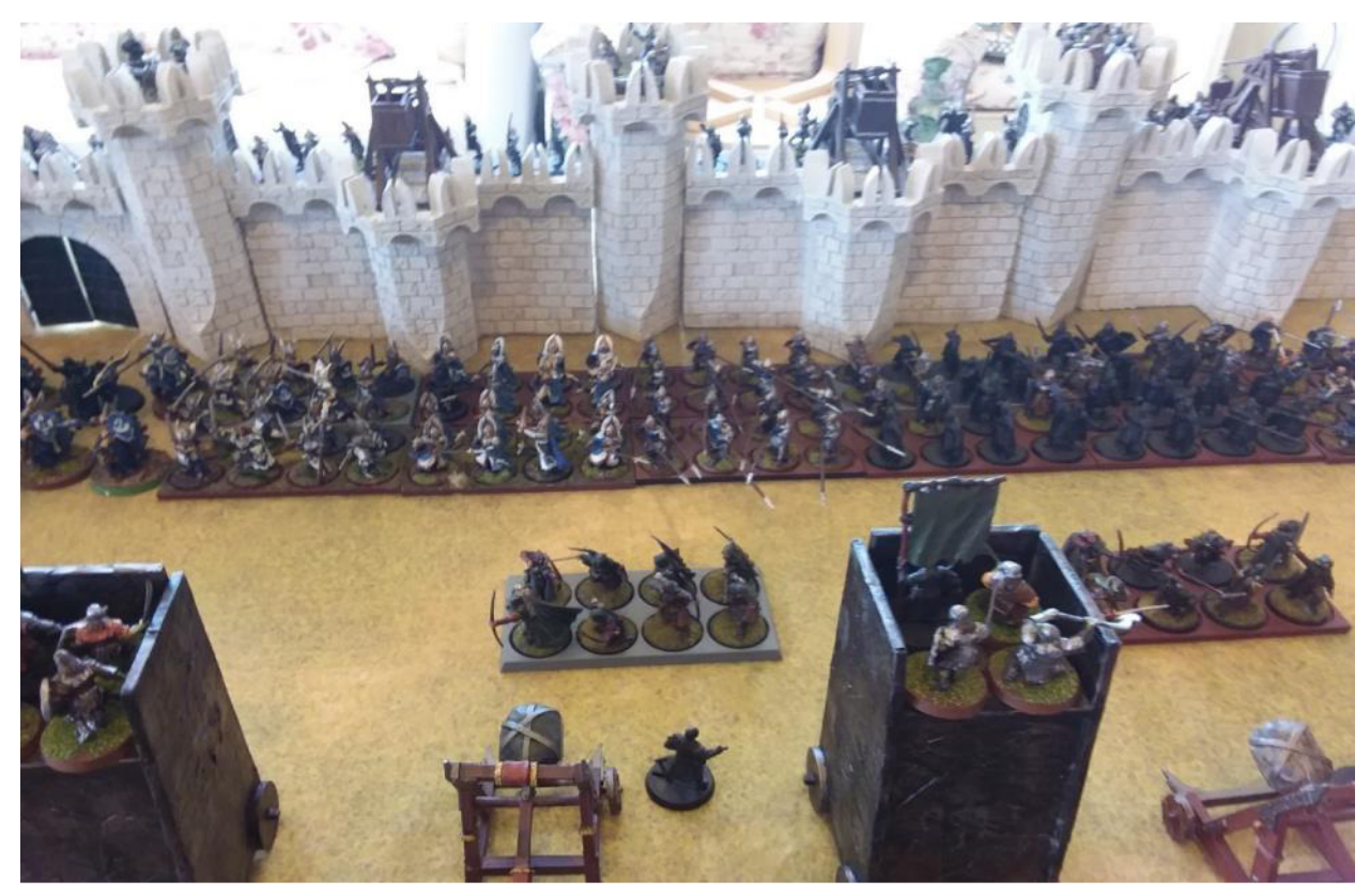
Prince Imrahil and his boys look pretty in blue!