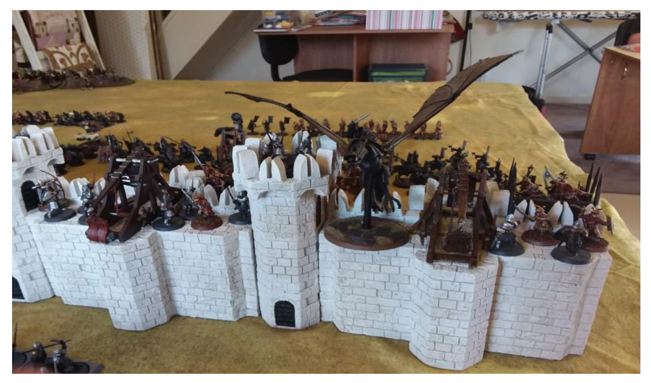
The Winged Nazgul is now on the city walls striking fear into the defenders (earplugs?), but what is that other sound in the distance?